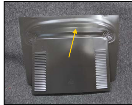
Mill Finish and Pre-Painted Galvanized One-Piece Covers Showing Acceptable Materials Variances