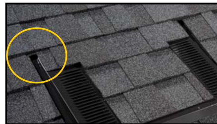
Shingle-Over Installation Finish Method