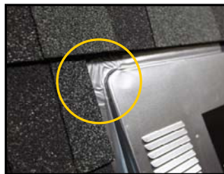
Minimal Visual Materials Variances Post Installation