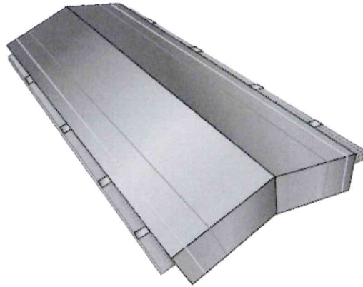
FIGURE 1 - O'HAGIN PITCH PERFECT CLIMATE RESISTANT SERIES (CRS) METAL RIDGE VENT FOR ASPHALT SHINGLE, WOOD SHAKE AND METAL ROOF COVERINGS