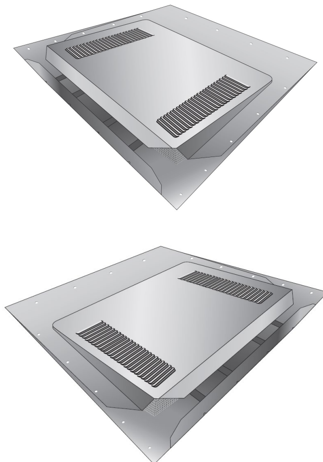
FIGURE 1 - O'HAGIN CRS LOW PROFILE VENT FOR SHINGLE, SHAKE, AND SLATE ROOFS

O'HAGIN MANUFACTURING, LLC 210 CLASSIC COURT SUITE 100 ROHNERT PARK, CALIFORNIA 94928 (877) 324-0444 https://www.ohagin.com