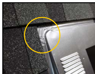
Minimal Visual Materials Variances Post Installation